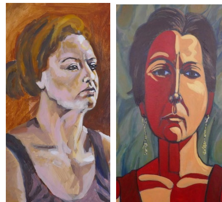
Examples of work from studio artists.