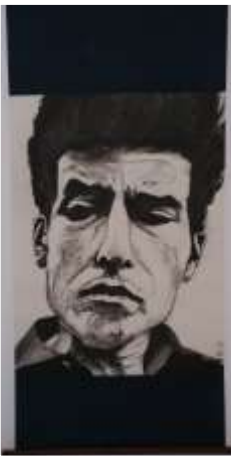
Artist: Donald Blue