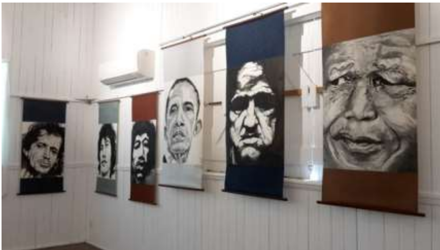
Some of the Faces