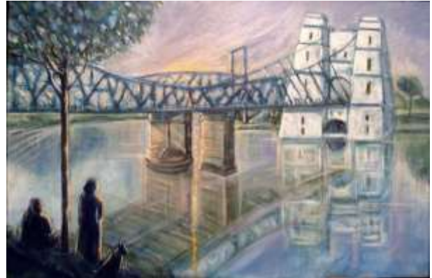
Walter Taylor Bridge

Also a big thank you to the members who submitted photos of their work at such short notice. They were all great! MP Graham Perrett's representative stated (quote): "The artworks were all amazing, it was very difficult for Graham to choose." (end quote)