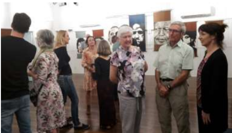
Enjoying the Opening Night

The opening night was held on Friday evening, 24th, and visitors enjoyed not only the great artwork and socialising, but also the background music which was representative of the faces depicted in the exhibition.