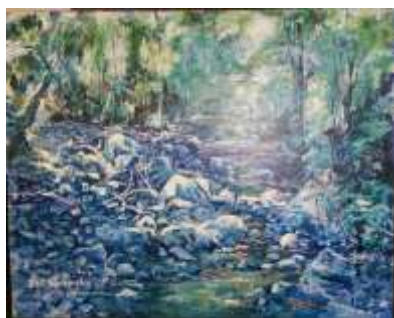
Thursday 20th July's