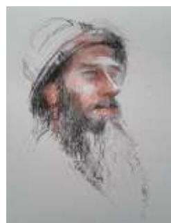
Above - Monday workshop "works in progress"