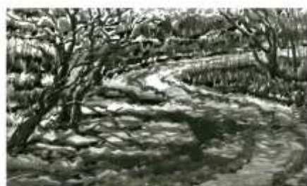
By Trevor Downes