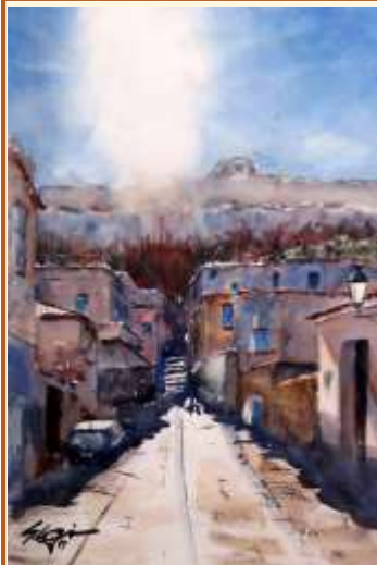
A Midday Walk in Plaka