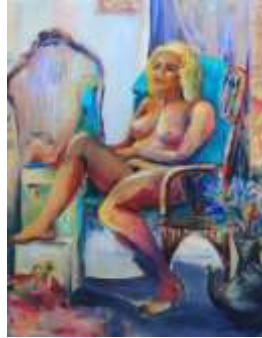
The Party's Over