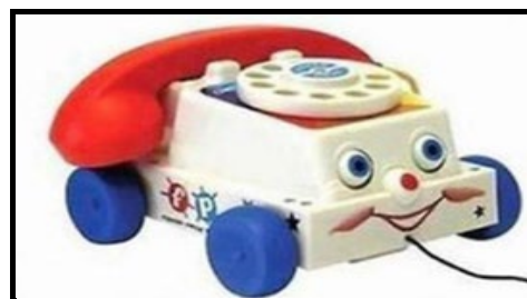
MY SON'S PHONE WHEN HE WAS SIX.