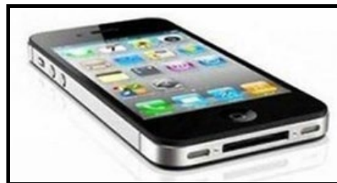
MY GRANDAUGHTER'S PHONE NOW SHE IS SIX.