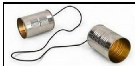
MY PHONE WHEN I WAS SIX.