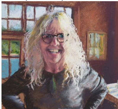
Fleur by Tricia Taylor

37 Quarry Road, Sherwood. Wednesday & 9th September. 2pm to 5pm. (2 Days). BYO lunch. Members $75. Non-Members $100