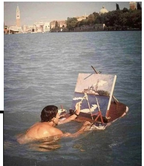
Salvador Dali painting while swimming in Venice, Italy. 1947.

are available on our website. Go to News/Newsletters and all will be revealed.