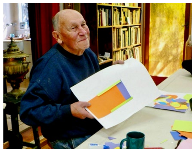
Participating in workshop by colleagues.