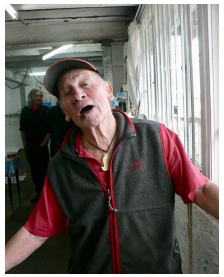
Keeping us happy at St Mary's Studio.