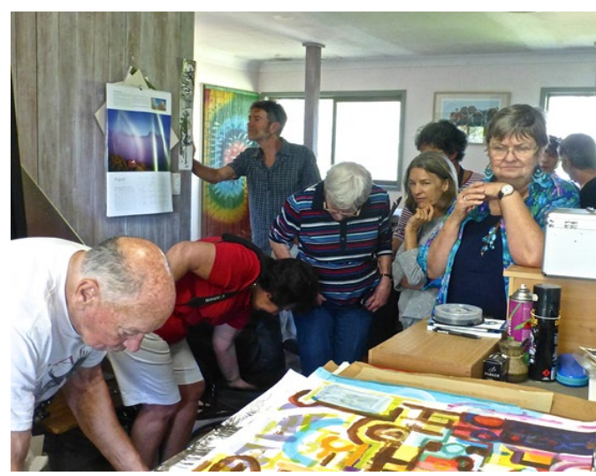
Hosting members to a survey of his Stradbroke Studio.