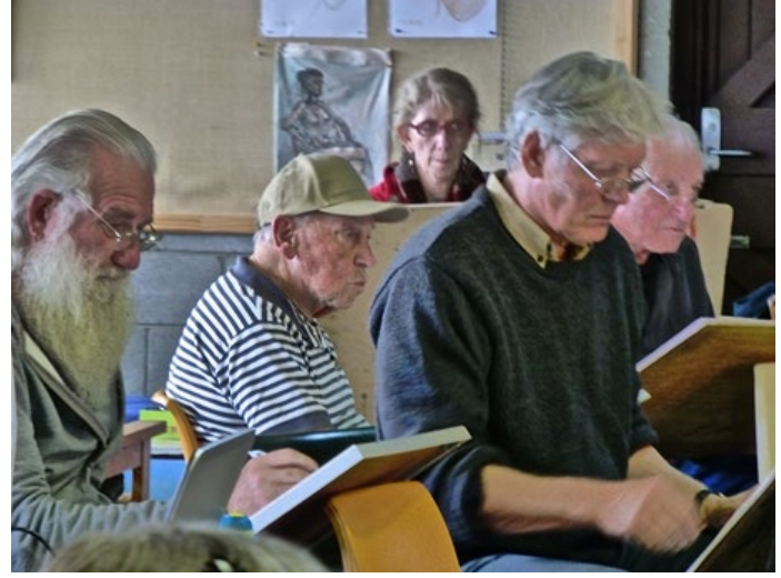
Attending Life Drawing class weekly.