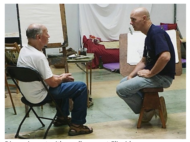
Discussing art with a colleague at Flipside.