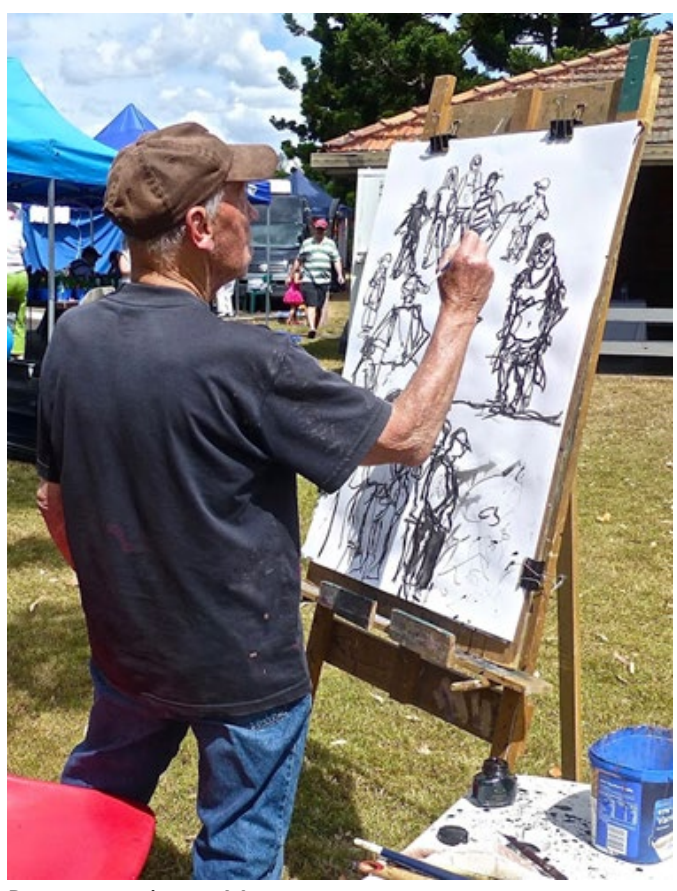
Demonstrating at Montrose.